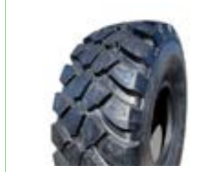
Polar Traction Plus Bead To Bead Mold