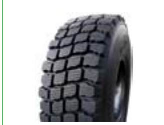
All Weather Trac Bead To Bead Mold