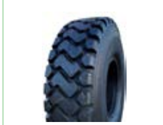
XHA Bead To Bead Mold