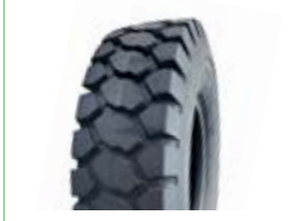
All Traction Plus